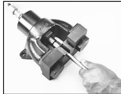
Fig. T34 – Hyferset tool

For full instruction on the use of the Hyferset Tool (see Fig. T34), please refer to Bulletin 4393-B1, which is included with each shipment of the Hyferset Kit #611049C.